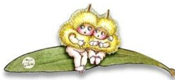
Wattle babies pin