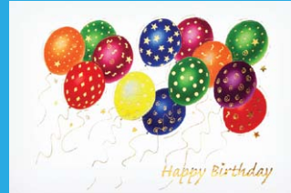
EHB67 Colourful Balloons