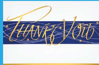
ETY865 Classic Thank You