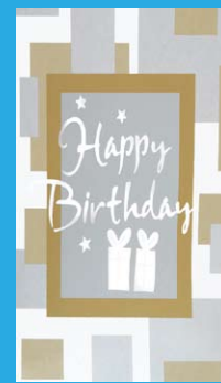
EHB702 Shiny Birthday