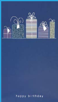
EHB601 Gifts a' plenty