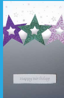
EHB800 Magical Stars

Order online at www.mycharitycards.com.au to receive an additional 5% DISCOUNT!