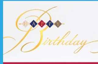
EHB832 Traditional Birthday