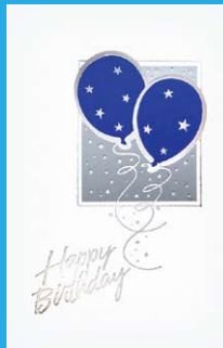
EHB843 Blue Balloons