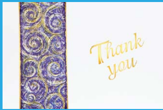
ETY831 Gold Thank You

whilst supporting your favourite Charity at the same time!