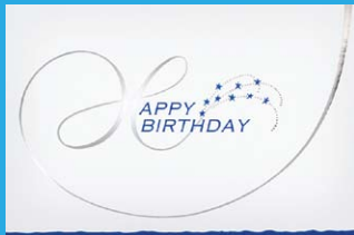
EHB821 Swirly Birthday wishes