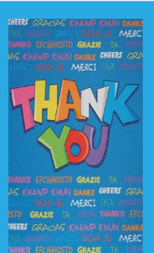
ETY712 Lots of Thank You's