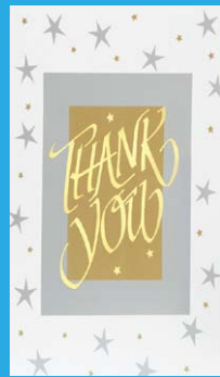
ETY701 Glistening Stars